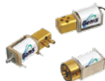
M Series Miniature Solenoid Valves