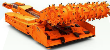
Mining & Construction Proven durability in high shock and vibration environments.