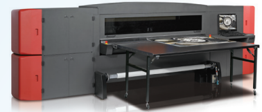
Printing Small footprint, lets XLS-1 easily fit into existing systems.