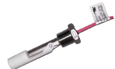
LS-7 Float Reed Switch