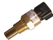
ETS Series Temperature Sensors