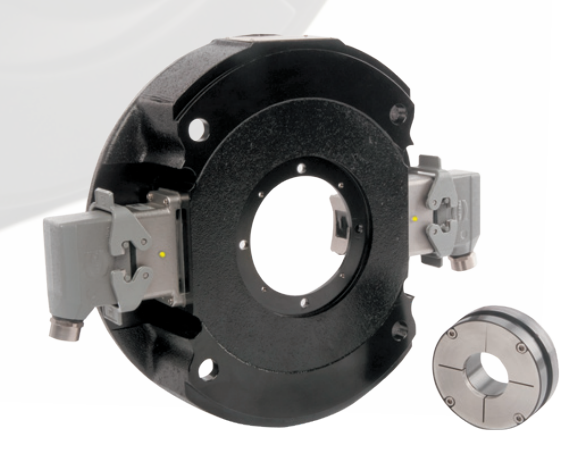
RIM Tach 1250 NexGen (RT1)