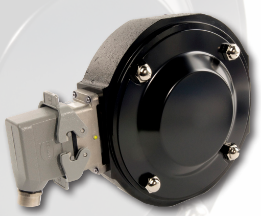
RIM Tach 8500 NexGen (RT8)