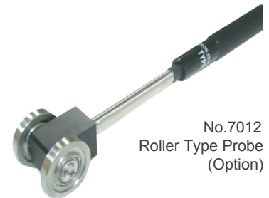
No.7012 Roller Type Probe (Option)