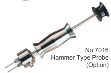
No.7016 Hammer Type Probe (Option)